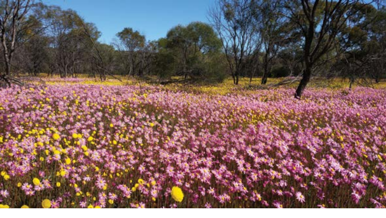
Above Coalseam comes alive in spring with an explosion of wildflowers.