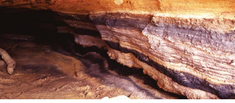
Front cover Riverbend. Above Coal seams are evident at sites along the banks of the Irwin River.