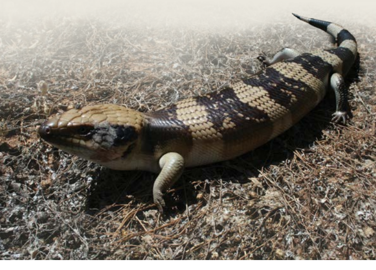
Above Blue tongue lizards are a common reptile in the park.