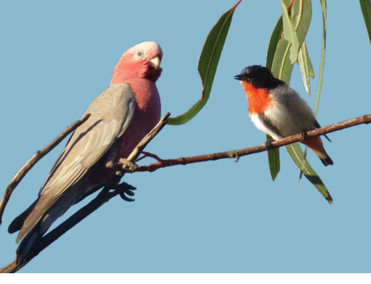
Above left Galah. Above right Mistletoe bird.