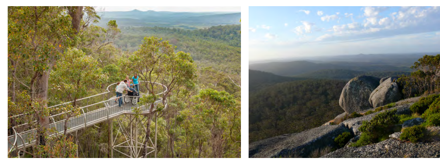
Above left Mt Frankland Wilderness Lookout. Above right Views from Mt Frankland summit.

Mount Frankland offers a number of places to experience and enjoy the natural wilderness. From the summit of this impressive granite monadnock, visitors are afforded spectacular 360 degree views of the surrounding landscape. Mount Frankland also features the impressive Mt Frankland Wilderness Lookout, which provides uninterrupted views of karri, tingle and jarrah forests, expanses of treeless heathland and distant granite peaks.