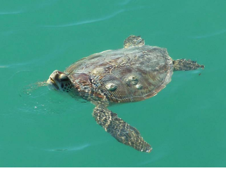
Above Green turtle.