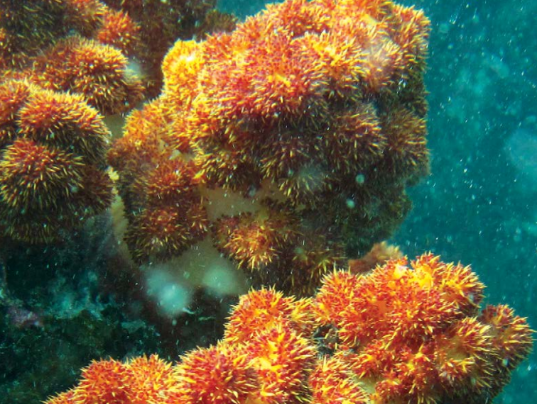
Front cover Fish community, Surf Point. Above Soft coral – off Dirk Hartog Island.

Welcome to Shark Bay, a place of exceptional natural beauty, diverse ecosystems, rare and endemic species, the world's largest communities of seagrasses and living fossils that offer a glimpse into the planet's evolutionary past.