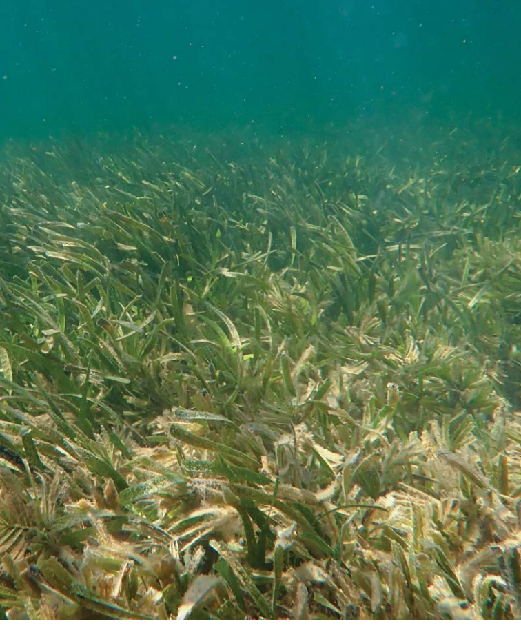
Above Seagrass in Shark Bay.