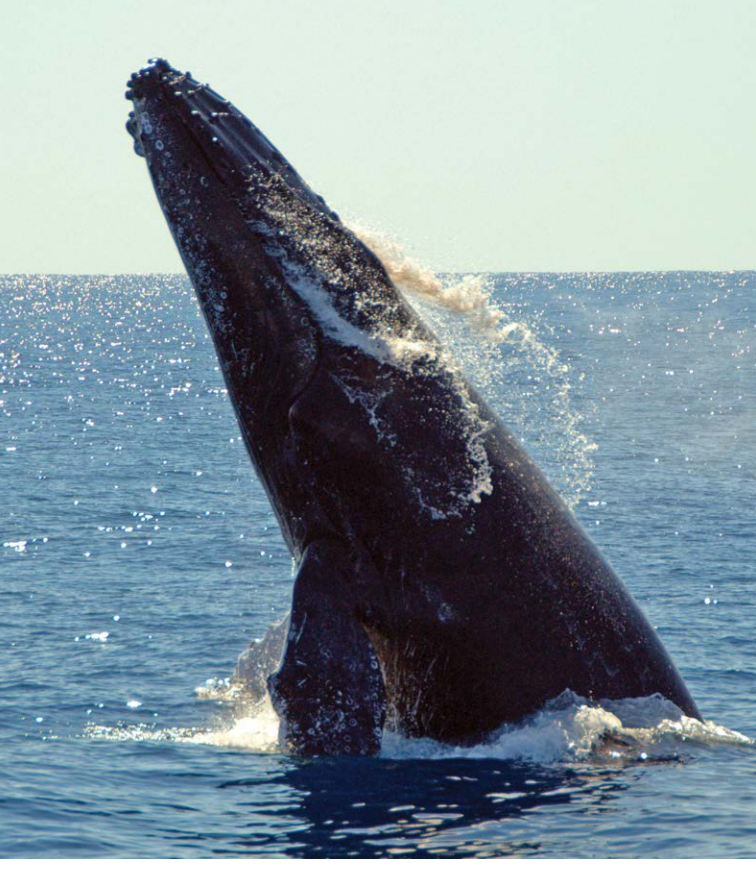
Above Humpback whale.