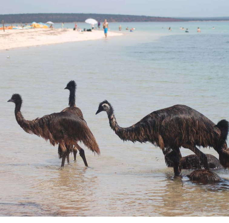
Above Emus bathing in Monkey Mia.