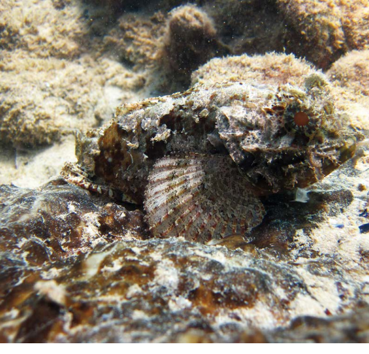
Above Stonefish are venemous and hard to see.