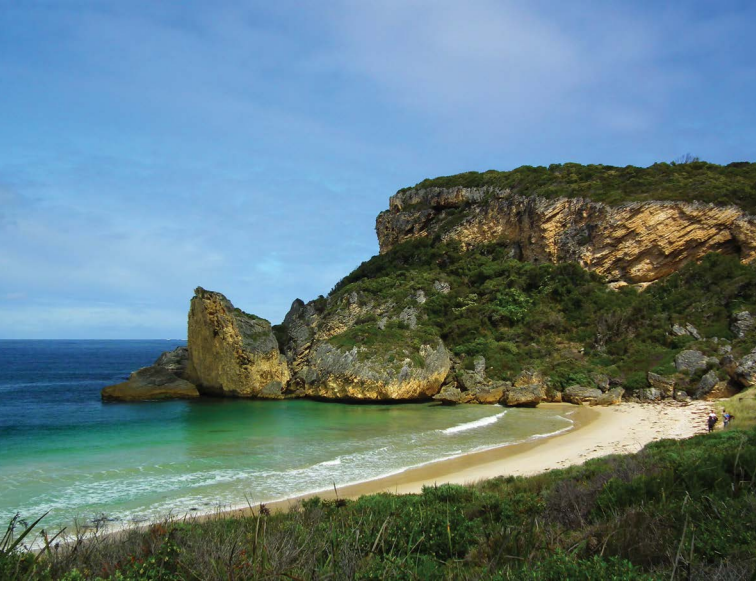
Above Cathedral Rock.