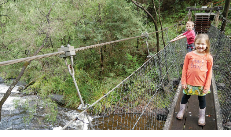
Above Greater Beedelup National Park. Below Brockman Sawpits.