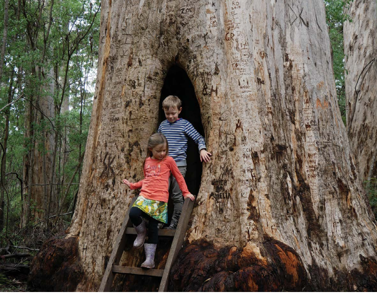
Above Greater Beedelup National Park.