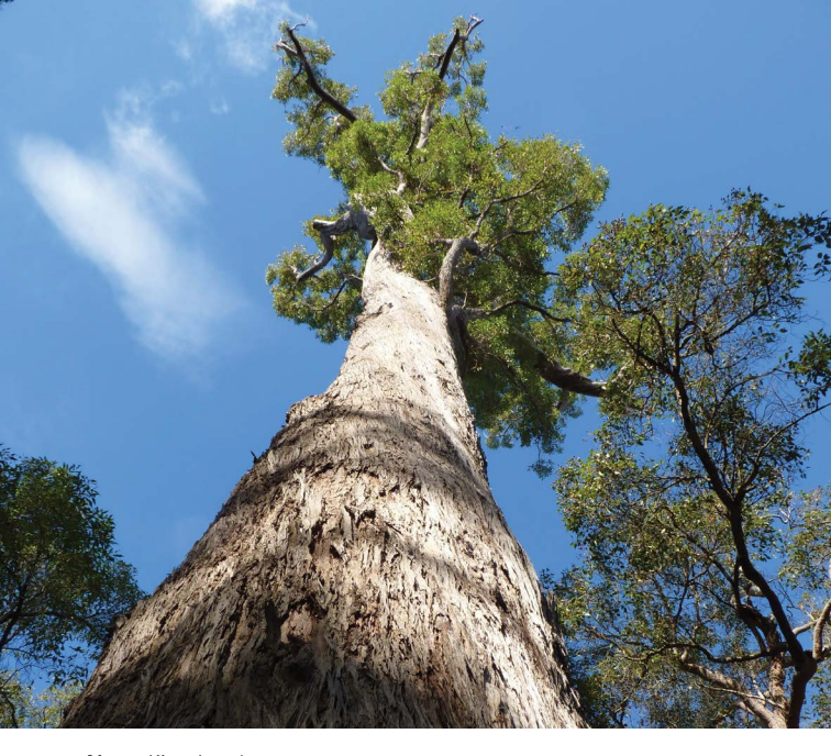
Above King Jarrah.