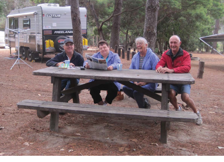
Above Shannon campground.