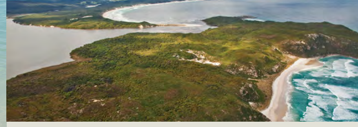
Far left Paddle boarding in the marine park. Top Nornalup Inlet mouth.