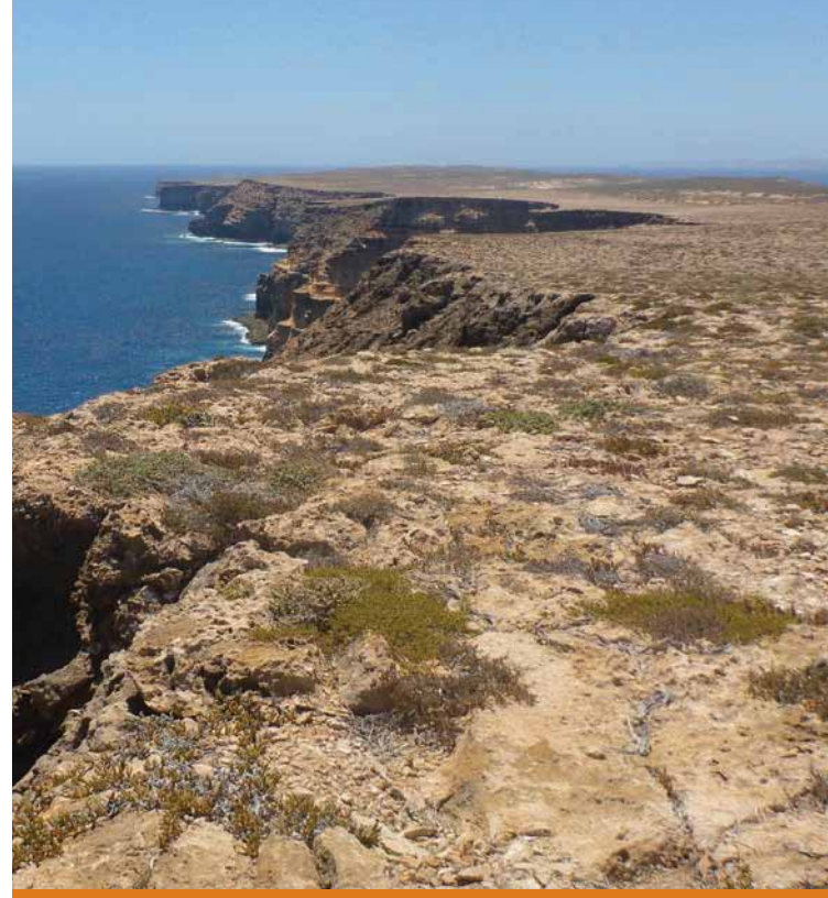
Zuytdorp Cliffs.

Settlement followed these voyages of discovery. Guano was stripped from Shark Bay's islands around 1850. Pearling started about the same time and continued into the 1930s when the shells were depleted through overfishing.