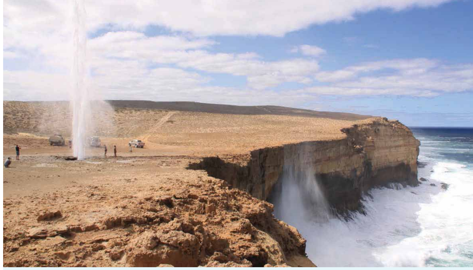
False Entrance blowholes.