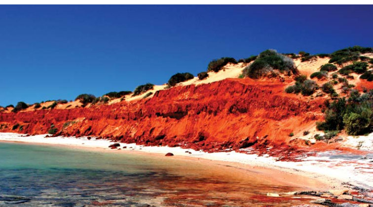
Above Bottle Bay.

Keep an eye out for the remains of a fish canning factory established in 1933 and converted to a fish freezer in 1938. The freezer was closed in 1947 when a new freezer plant was built in Denham. You can launch small boats here over very soft sand.