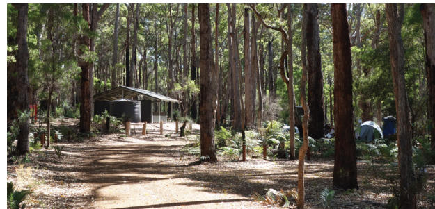
Jarraldene Campground, Leeuwin-Naturaliste National Park.

For more information visit dbca.wa.gov.au , contact any Parks and Wildlife Service office or phone the information line on (08) 9219 9000.