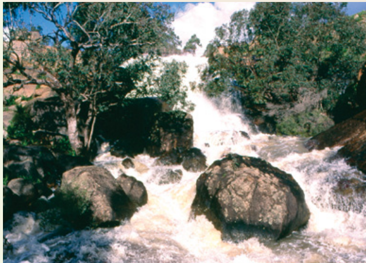
Below National Park Falls, John Forrest National Park.

In some sections the trail makes use of the management tracks which run throughout the park, while other sections are purpose-built as walking tracks. Along its whole length, you will be guided by the yellow triangle emblem with the eagle silhouette. Sometimes these are slightly less frequent when the trail coincides with another walk trail, such as along the northern side of Jane Brook. The trail is marked every two kilometres and sign-posted with the letters that appear on the map overleaf, with junction and turning points well indicated.