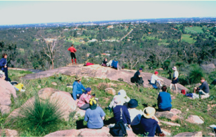
Above Bushwalkers on Eagle lookout.

The Eagle View Walk Trail is a 15-kilometre bushwalking circuit that leads you to several of John Forrest National Park's less explored destinations. The trail is a bushwalker's delight, covering a variety of relatively pristine habitats. It's also more challenging than other trails in the park, but your efforts are well rewarded. Be sensible and allow plenty of time for the walk which, depending on your level of fitness, will take from about four-and-a-half to seven hours. This also depends on your interest in your surroundings as you go along.