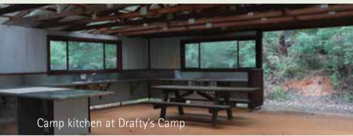
Camp kitchen at Drafty's Camp