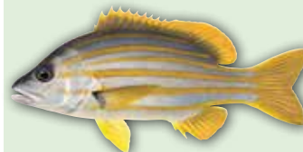
Stripey seaperch (Spanish flag)